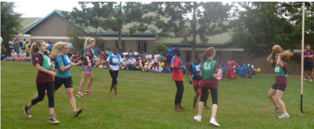
Bellow; are WGS and LMVC girls during a netball match. WGS school won the match. LMVC girls were overwhelmed by the WGS skills.