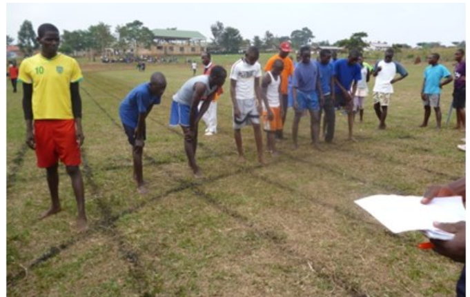
Above: Boys preparing for 800 meters race. One of the most competitive races of the afternoon