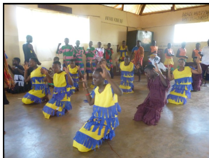
S.3 presenting the creative dance