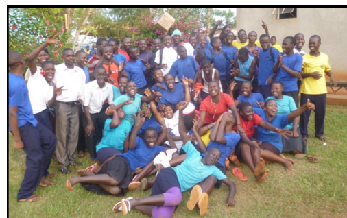
S.3 celebrating their victory