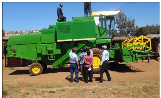
This John Deere combine harvester was found near Iten and was studied closely.