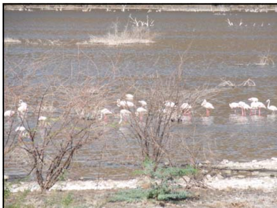
Flamingos at Lake Bogoria, one of the alkaline lakes in the Rift Valley