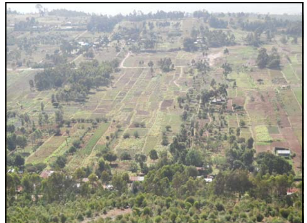
Looking over the step fault at Kijabe across into the Great Rift Valley. Cultivation was studied carefully.