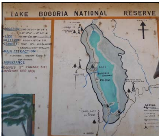
The map of Lake Bogoria. Lake Bogoria was one of the lowest points, and hottest, of the trip.