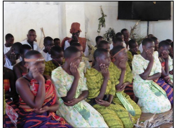
A traditional folk song presentation