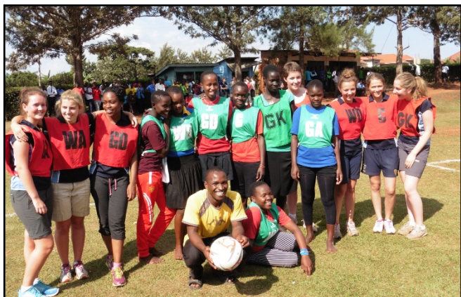
Above: A group photograph of both teams before the netball match between WGS, in red bibs and LMVC in green bibs.

Bellow are the pictures of activities during the visit by Wolverhampton Grammar School.