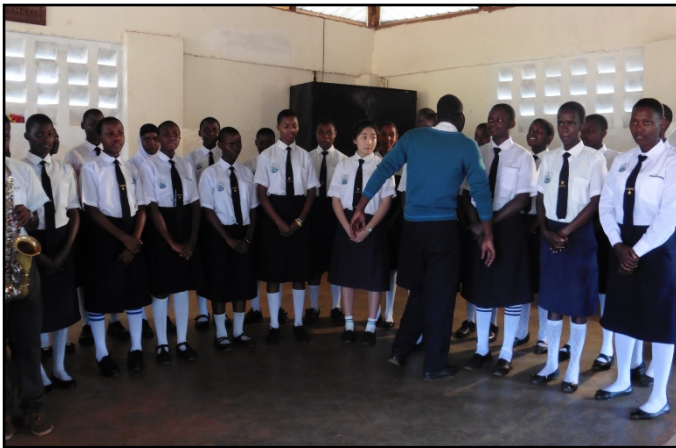
One of the presentations; Zebra house presenting the school anthem.

Zebra house won the competitions and took a trophy and a bull.