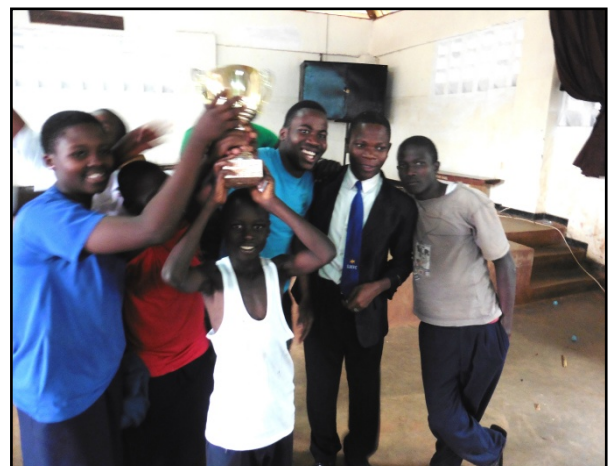
The winning house, Zebra who took home a Trophy and a bull.