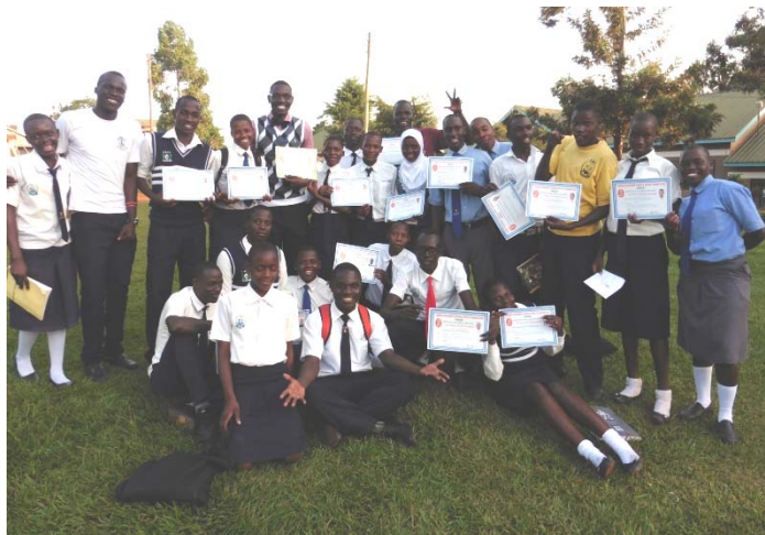
LMVC team that represented the Buikwe District in Gulu National Athletics Competitions posing with their certificates.

CAN YOU HELP? Please donate any amount so that the Trust's work can continue to help vulnerable youth to obtain education, accommodation and health services so they may have a better future. A full sponsorship for one year costs £360 or US$720. £1 (US$2) a day educates a child!