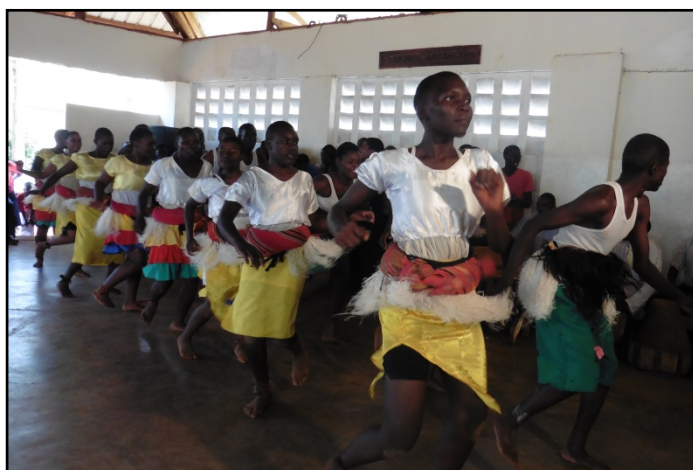
A traditional dance