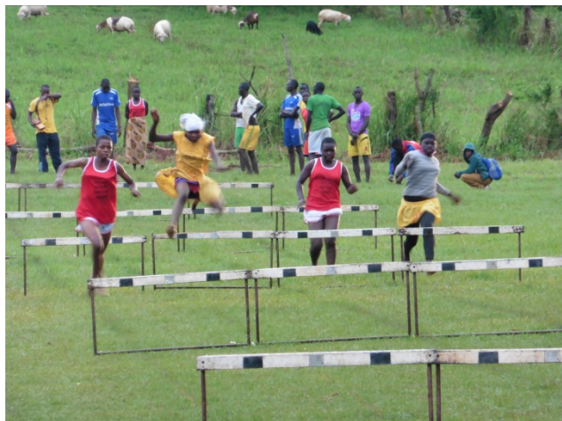
Girls competing in hurdles during the Buikwe District competitions at Lords Meade Vocational College

We are happy to inform you that LMVC had a good representation as a good number on the team that represented the district in Gulu, for the national secondary schools athletics competitions.