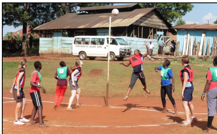
Above: The action during the netball match which was won by WGS