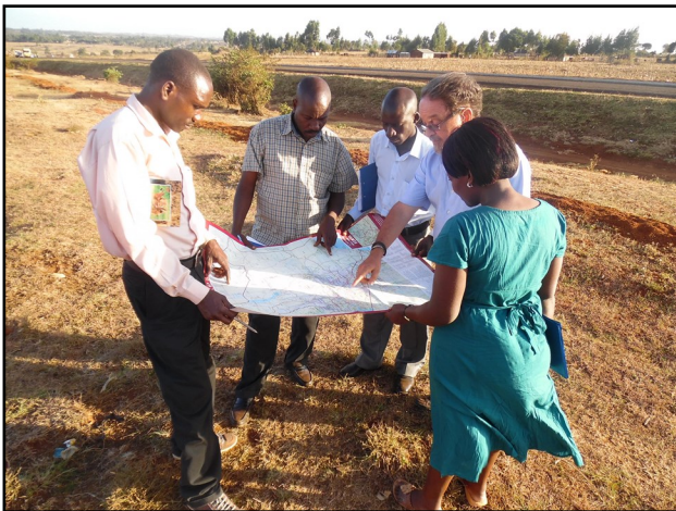
The Director and staff reading a map during the staff to western Kenya

These study trips are organized for training students who are well equipped and open minded becoming all round job creators.