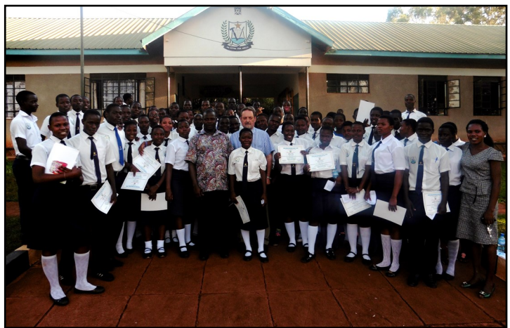
2015 senior four candidates after receiving their leaver's certificates

Though the boys are still performing much better than the girls, it should also be noted that there was an overall improvement amongst the girls in general with an increased number sitting and completing their examinations which is a huge accomplishment here in Uganda and we stand proud of our girls and are expecting much more from the future generations as girls start to pave way for a new, brighter future.