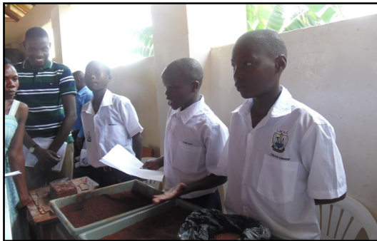
Above; Senior one exhibiting how to make sodium for animal feeds

This year, Lords Meade Vocational College participated in the Uganda Science Education Program (USEP), a national program aiming at improving the teaching and learning of science. We organised an internal exhibition in March, then hosted the regional competitions in June. Our students did well on both occasions. Below; students during the internal inter class USEP exhibitions